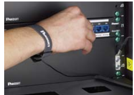
Figure 4. ESD wrist straps and ports enhance equipment protection.

tions because the connector barrel will not loosen from the conductor over time.