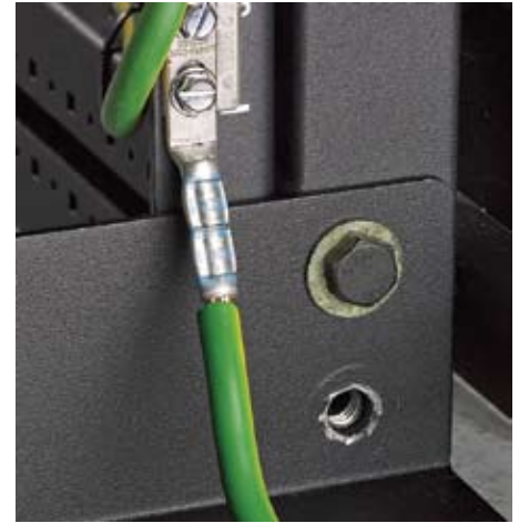
Figure 3. Grounding washers can be used to create electrical continuity in racks and cabinets. In this photo a bolt and washer is removed, showing paint removal from the contact area (bottom right).

In larger installations, the number of lug mounting locations on the busbar and the management of the grounding cables present a more complicated bonding situation. Under these circumstances the installer should run a continuous TEBC from the TGB down each row of racks, making a bond from the TEBC to each rack. These jumpers should be bonded to the TEBC using compression HTAP connectors, and bonded to the rack using a two-hole compression lug. The use of this lug at the rack is quite important, as this is a series circuit (where only one connection is made between rack and TEBC) and a two-hole compression lug will maintain the reliability of the connection at the same level as connections to the TGB. Compression connectors are required by many grounding standards and specifica-