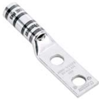
Figure 1. Two-hole compression lug required by J-STD-607-A.